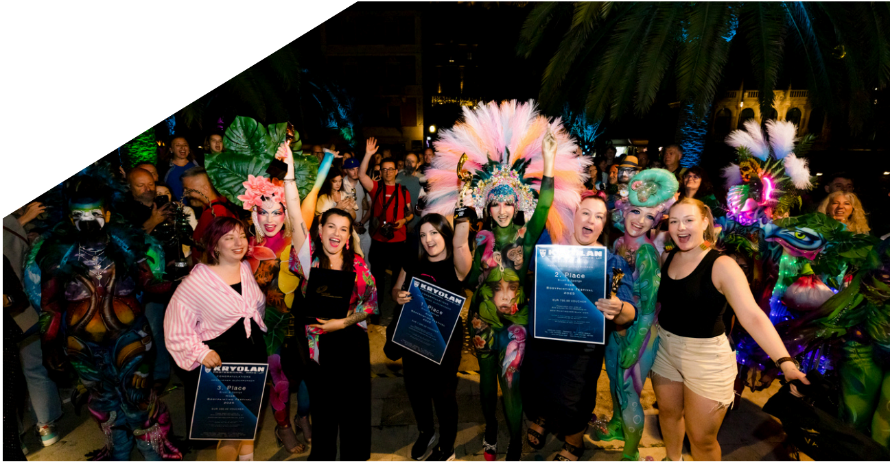
Winners of the Brush/Sponge category